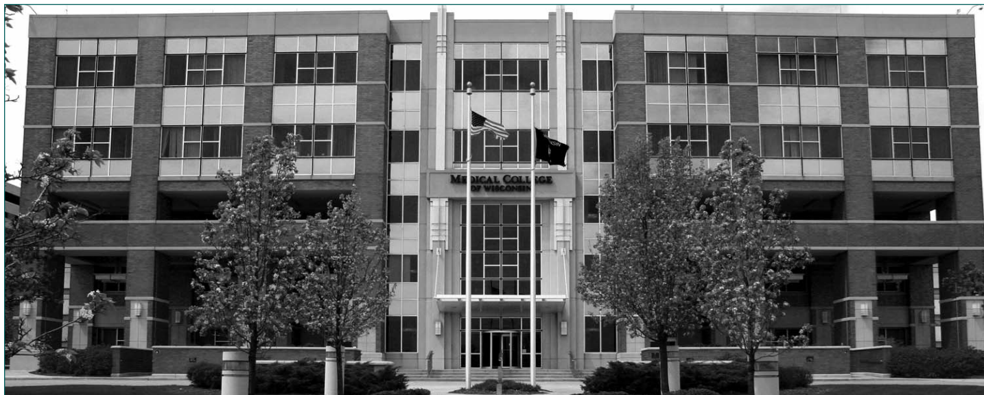
The Medical College of Wisconsin's Health Research Center serves as the College's front entrance (on 87th St., just south of Watertown Plank Rd.)

8701 Watertown Plank Road • Milwaukee, Wisconsin 53226 • 414-955-8296 • www.mcw.edu