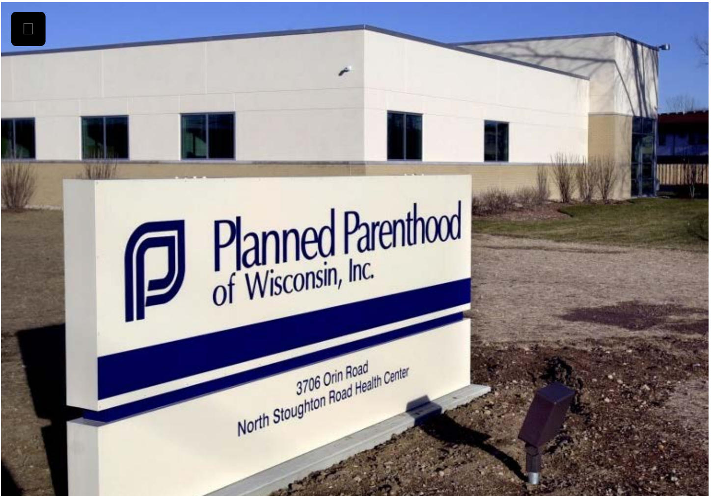
State Journal file photo

JESSICA VANEGEREN | The Capital Times | jvanegeren@madison.com Sep 25, 2014 67