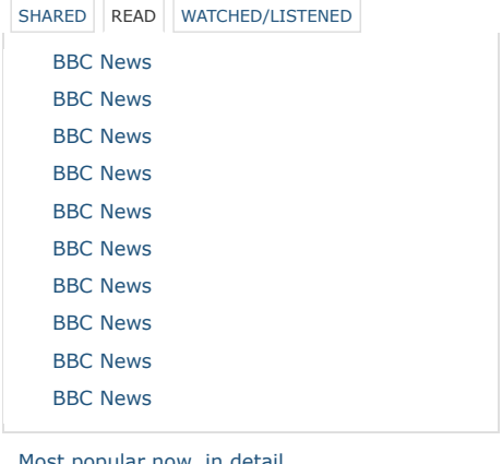
Most popular now, in detail