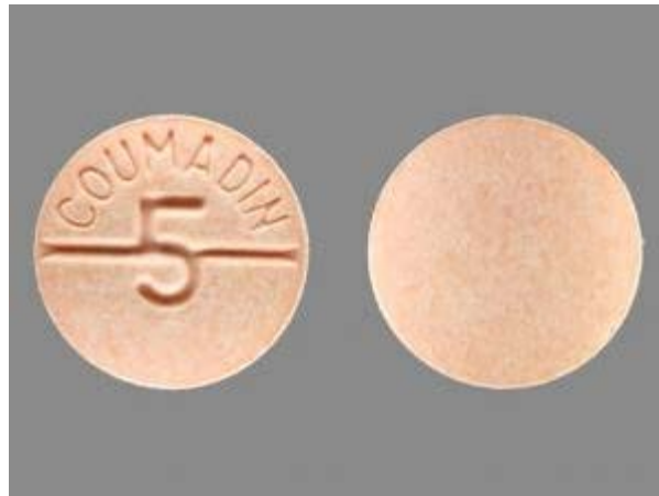
Coumadin (warfarin) 5 MG