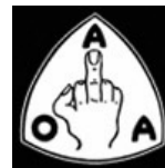
AOA Logo (...the answer)