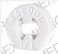
Haldol 0.5 MG (HALDOL 1/2 )