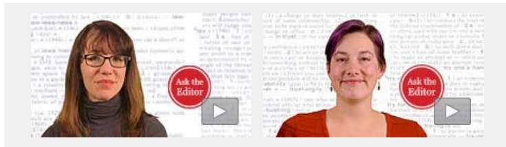
Lay vs. Lie