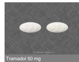
Tramadol 50 mg