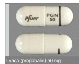
Lyrica (pregabalin) 50 mg