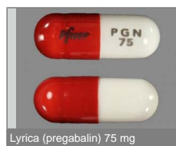
Lyrica (pregabalin) 75 mg