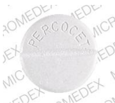
Percocet (acetaminophen / oxycodone) 325 mg / 5 mg