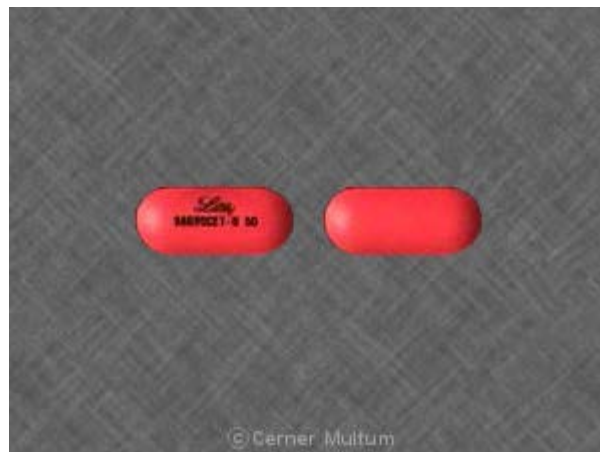
Darvocet-N 50 (acetaminophen / propoxyphene) 325 mg / 50 mg