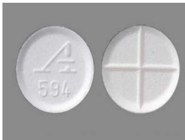
Zanaflex (tizanidine) 4 mg