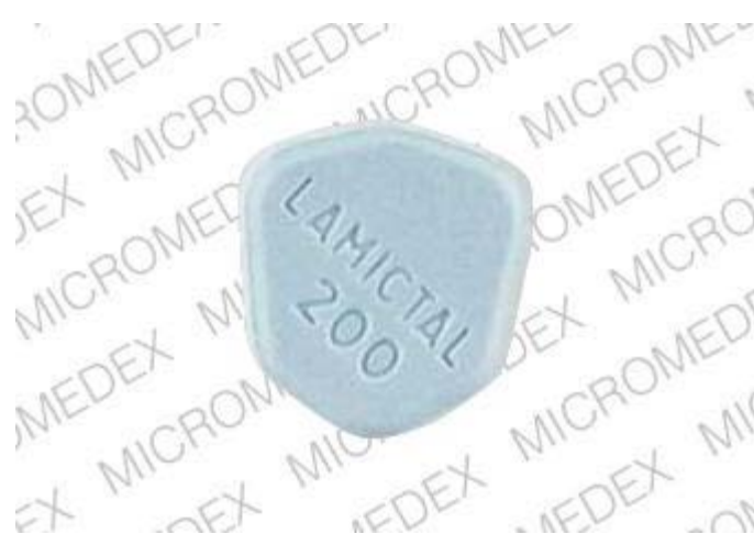
Lamictal (lamotrigine) 200 mg