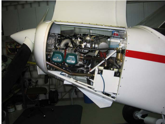
Visit Jože Lukanc's build story