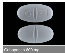
Gabapentin 600 mg