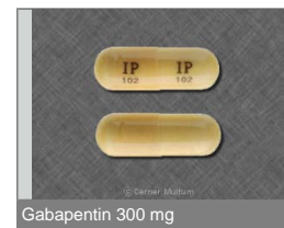
Gabapentin 300 mg