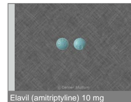
Elavil (amitriptyline) 10 mg