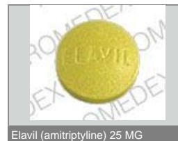
Elavil (amitriptyline) 25 MG