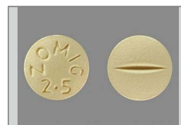
Zomig (zolmitriptan) 2.5 mg