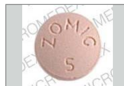
Zomig (zolmitriptan) 5 mg