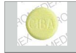
Ritalin (methylphenidate) 5 mg