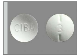
Ritalin (methylphenidate) 10 mg