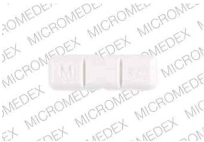
BuSpar (buspirone) 15 mg