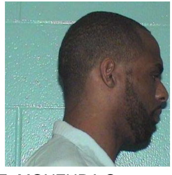
B53779 - PORCHE, MONZURA S.

Parent Institution: ROBINSON CORRECTIONAL CENTER