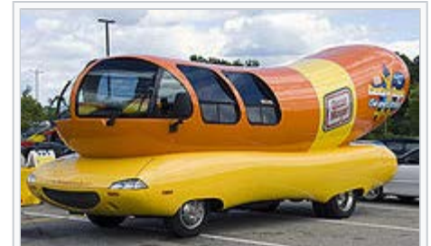
Wienermobile in Gilford, New Hampshire [ edit ]

In August 2017, Bloomberg Businessweek reported that the company planned to spend $10 million to reinvent the hot dog for a more health conscious consumer. According to company research, this new strategy could increase sales of their hot dog by six percent. [5]