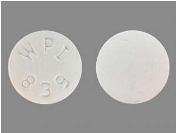
Bupropion 150 mg