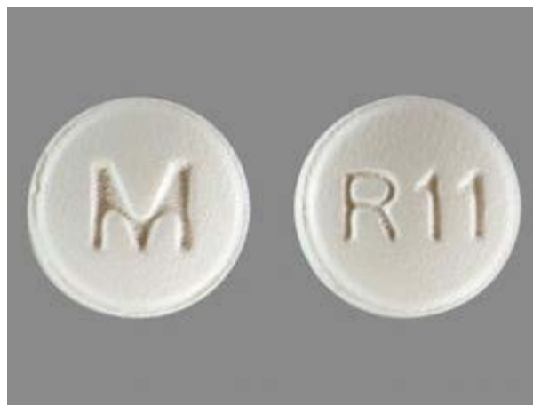
Risperidone 1 mg