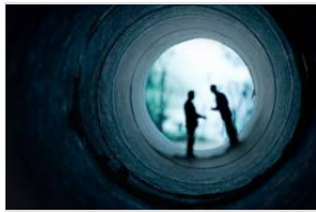
A Brief History of 'Complicit'