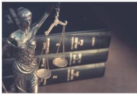
Trending: 'Unwitting' and 'Hoax' Spike After Russians'