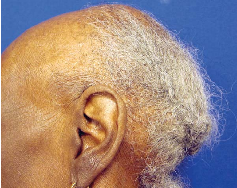
Figure 5. Traction alopecia. Symmetric frontal and temporal hair loss in a black woman.