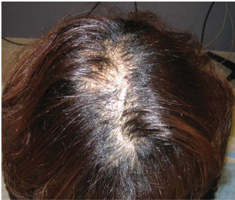
Figure 6. Central centrifugal cicatricial alopecia. Central scarring hair loss expanding outward on the crown in a black woman.

the recommended treatment time. Heat, via pressing combs (hot combs) or flat irons, is an alternative method to straighten the hair. Pressing combs are metal combs heated by an external heating source and pulled through the hair to straighten. Hair breakage and thermal burns can occur. It is