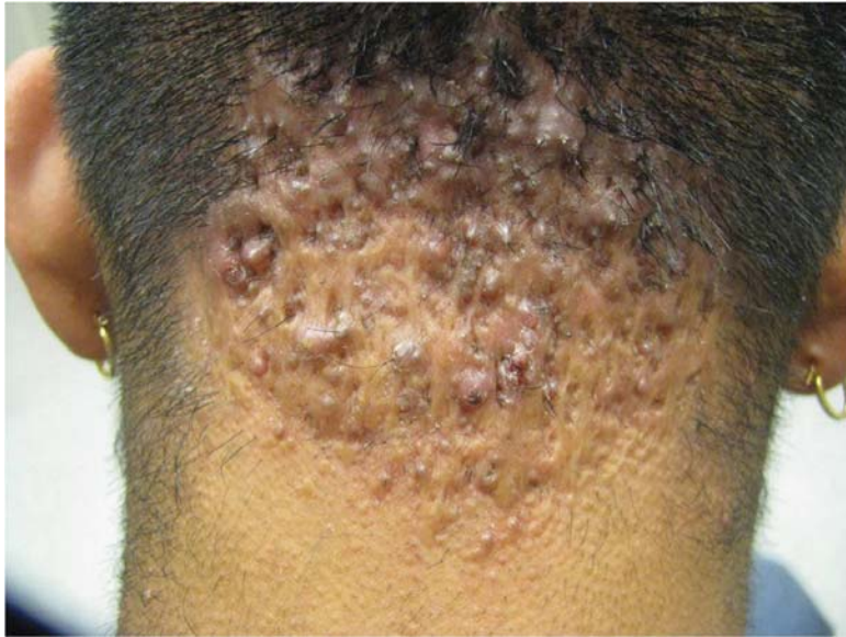
Figure 3. Acne keloidalis nuchae. Firm, pink papules coalescing into a keloidal plaque in a young Hispanic patient. Significant hair loss is noted in the affected area.

(class I and II), intralesional steroids, topical and oral antibiotics, topical and oral retinoids, imiquimod (Aldara), laser therapy, and surgical excision. 14,19,20 Initial therapy begins with topical steroids, topical antibiotics, or both. Because treatment can be challenging, a combination of these therapies is usually indicated. Topical steroids in combination with topical antibiotics or retinoids can be effective in flattening lesions and decreasing symptoms. For draining or purulent lesions, bacterial culture permitting appropriate oral antibiotic selection is helpful.