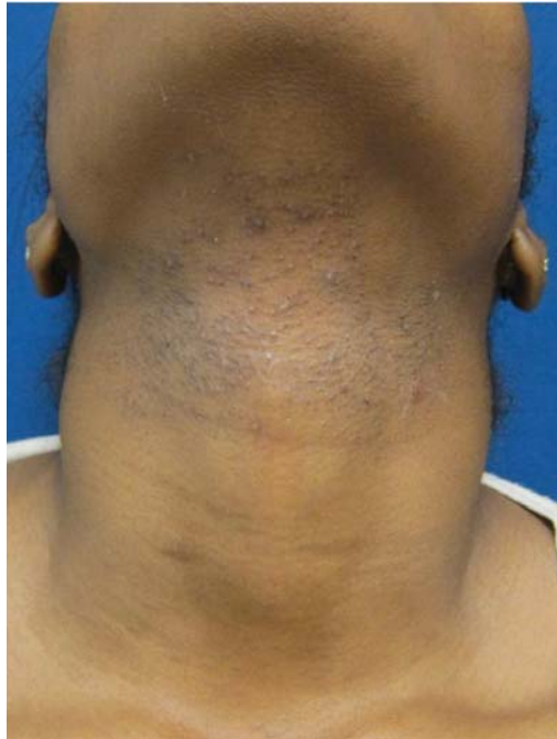
Figure 2. Pseudofolliculitis barbae. Hyperpigmented and skin-colored papules and macules in a beard distribution on a black patient.