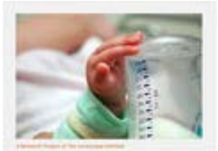
Infant Formula Report