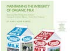
Organic Dairy Report & Scorecard