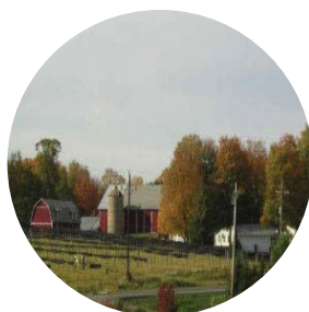
Ginseng garden on beautiful Wisconsin farmland