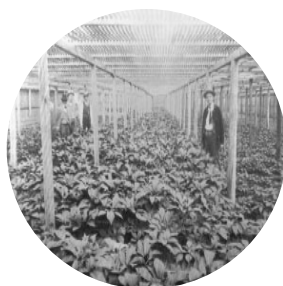
Inspecting ginseng, 1930