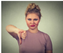
12 Insults We Should Bring Back

( http://www.dictionary.com/slideshows/simpsons-only-words?