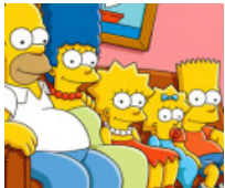
The Simpsons Created a Hilarious New Language

Explore Dictionary.com ( http://blog.dictionary.com )