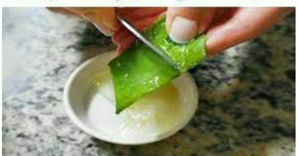
1 Brilliant Tip Removes Wrinkles & Eye Bags