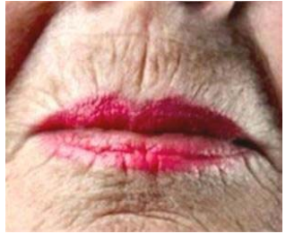
1 Simple Trick Removes Eye Bags & Lip Lines In Seconds