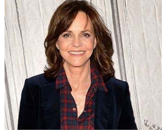
We Say GoodBye To Sally Fields