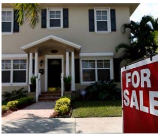
Homeowners Born Before 1985 Get A Big Pay Day