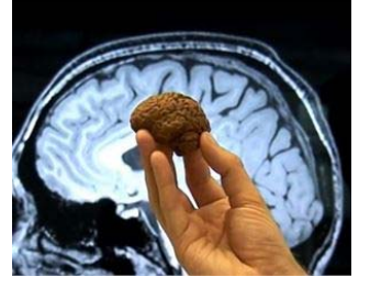
Scientists: Tinnitus Has Nothing To Do With Your Ears