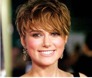
15 Hairstyle Ideas that Will Knock 10 Years Off Your Age