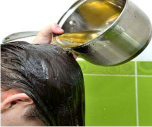
Hair Loss Specialist Shocked How Fast This Regrows Hair