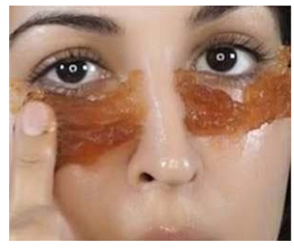
1 Simple Trick Removes Eye Bags & Lip Lines in Seconds