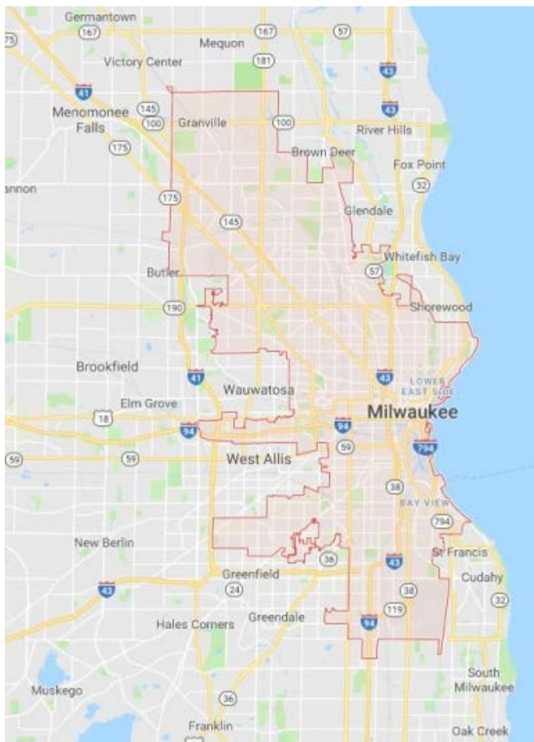
Milwaukee Wisconsin City Limits

experienced higher rates of homicides and non-fatal shootings since