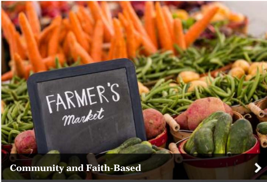
Community and Faith-Based