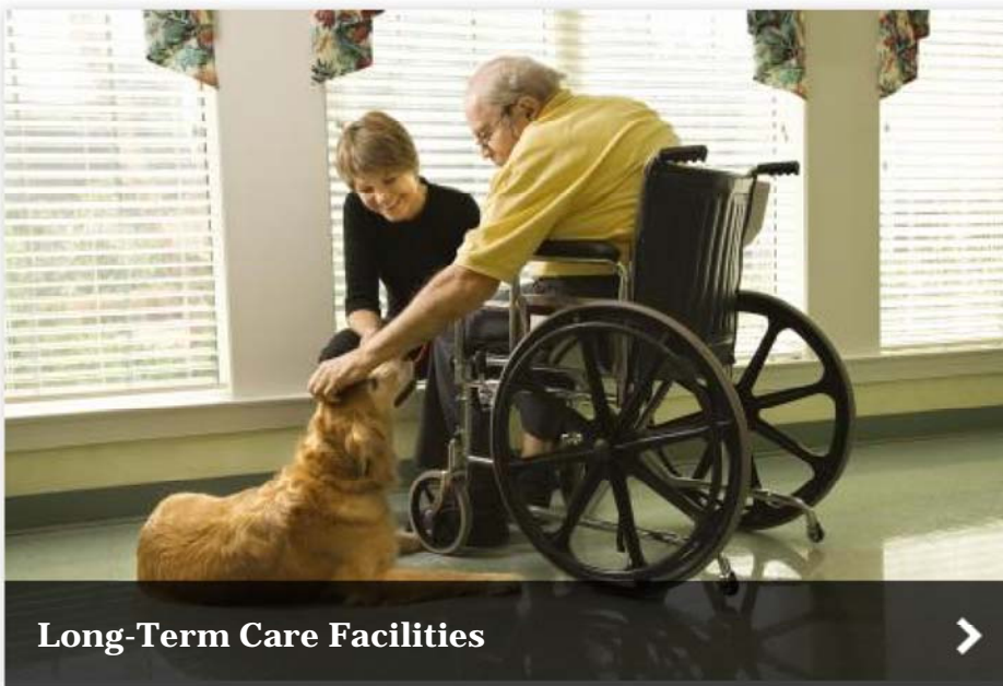
Long-Term Care Facilities