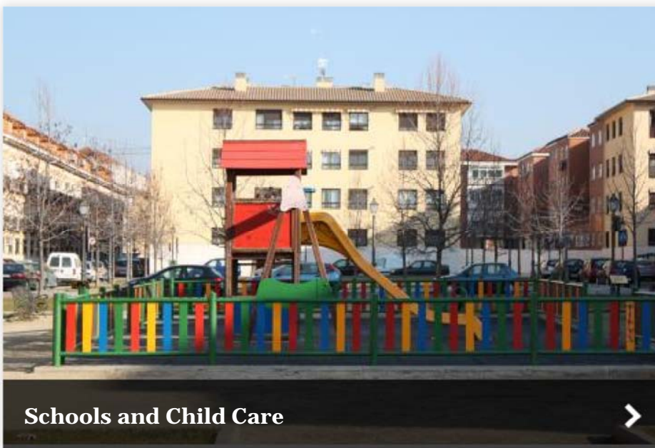
Schools and Child Care