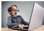
Avoid these words. Seriously