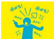
Insults We Should Bring Back