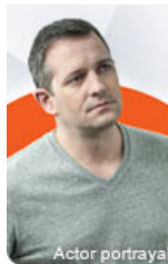
Actor portrayal XP-05495/September 2018

Do not receive XIAFLEX® if you: have been told by your healthcare provider that the Peyronie's plaque to be treated involves the "tube" that your urine passes through (urethra) are allergic to collagenase clostridium histolyticum or any of the ingredients in XIAFLEX® or to any other collagenase product. See the end of the Important Safety Information | Prescribing Information | Medication Guide