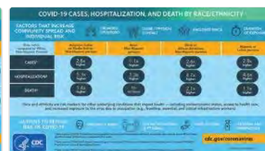
COVID-19 Hospitalization and Death by Race/Ethnicity