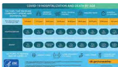
COVID-19 Hospitalization and Death by Age