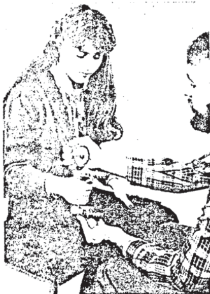
Fig 1—Grip strength measurement: This standardized arm and hand positioning was used for all hand strength measurements.

norms for men and women aged 20 to 75+ years for hand strength evaluations based on standardized procedures and instructions. 12 A second purpose was to compare the hand strength of dominant and nondominant hands.