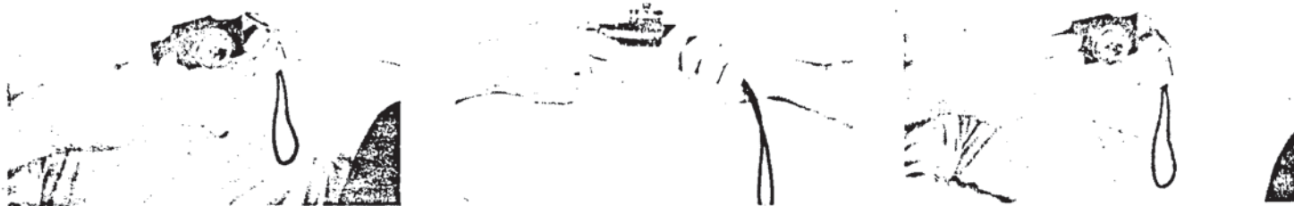
Fig 2—Tip pinch (left) is thumb tip to index fingertip. Key pinch (center) is thumb pad to lateral aspect of middle phalanx of index finger. Palmar pinch (right) is thumb pad to pads of index and middle fingers.

The B&L pinch gauge, used to measure tip, key, and palmar pinch, was held by the examiner at the distal end to prevent dropping. Scores were read on the needle side of the red read-out marker. The calibration of both instruments was tested periodically during the study.