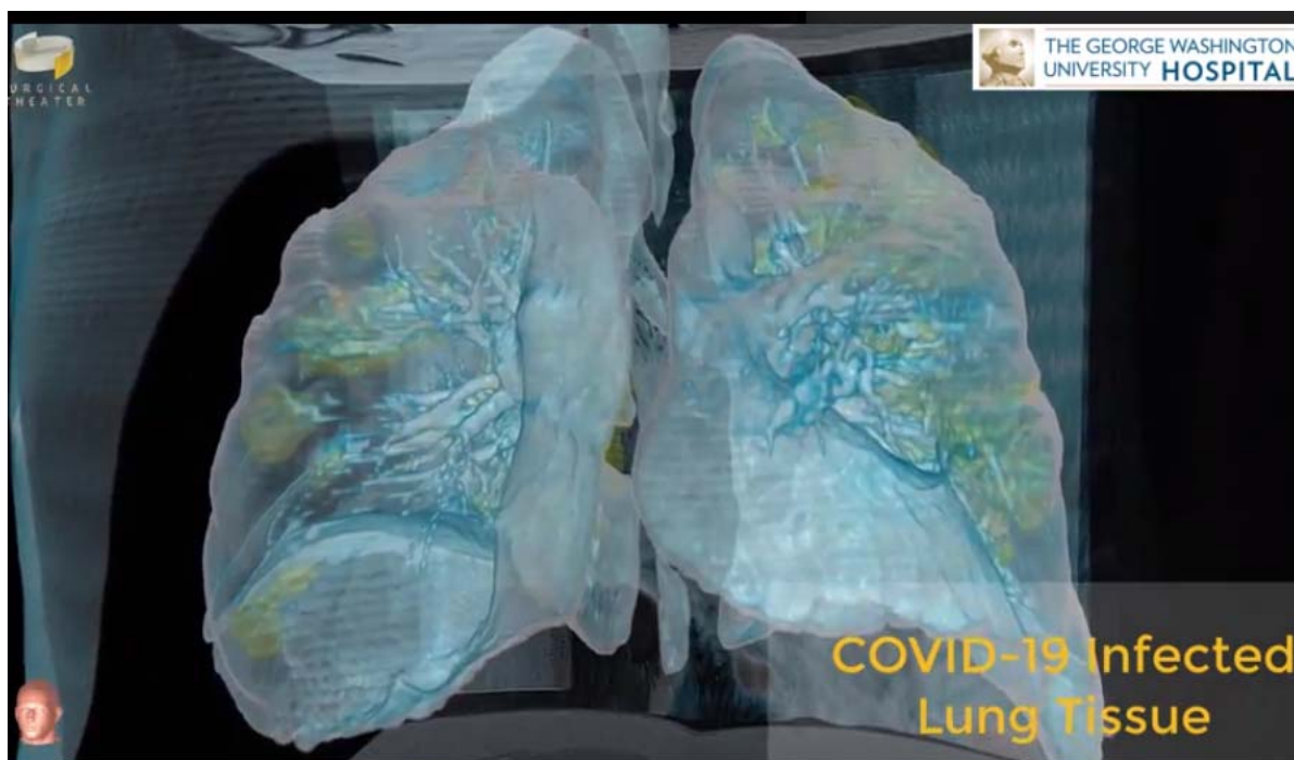
Image showing lung tissue infected by COVID-19

“It is affecting every age group and every country, all 50 states in the U.S., so this is nationwide, a global, a community problem,” he said.