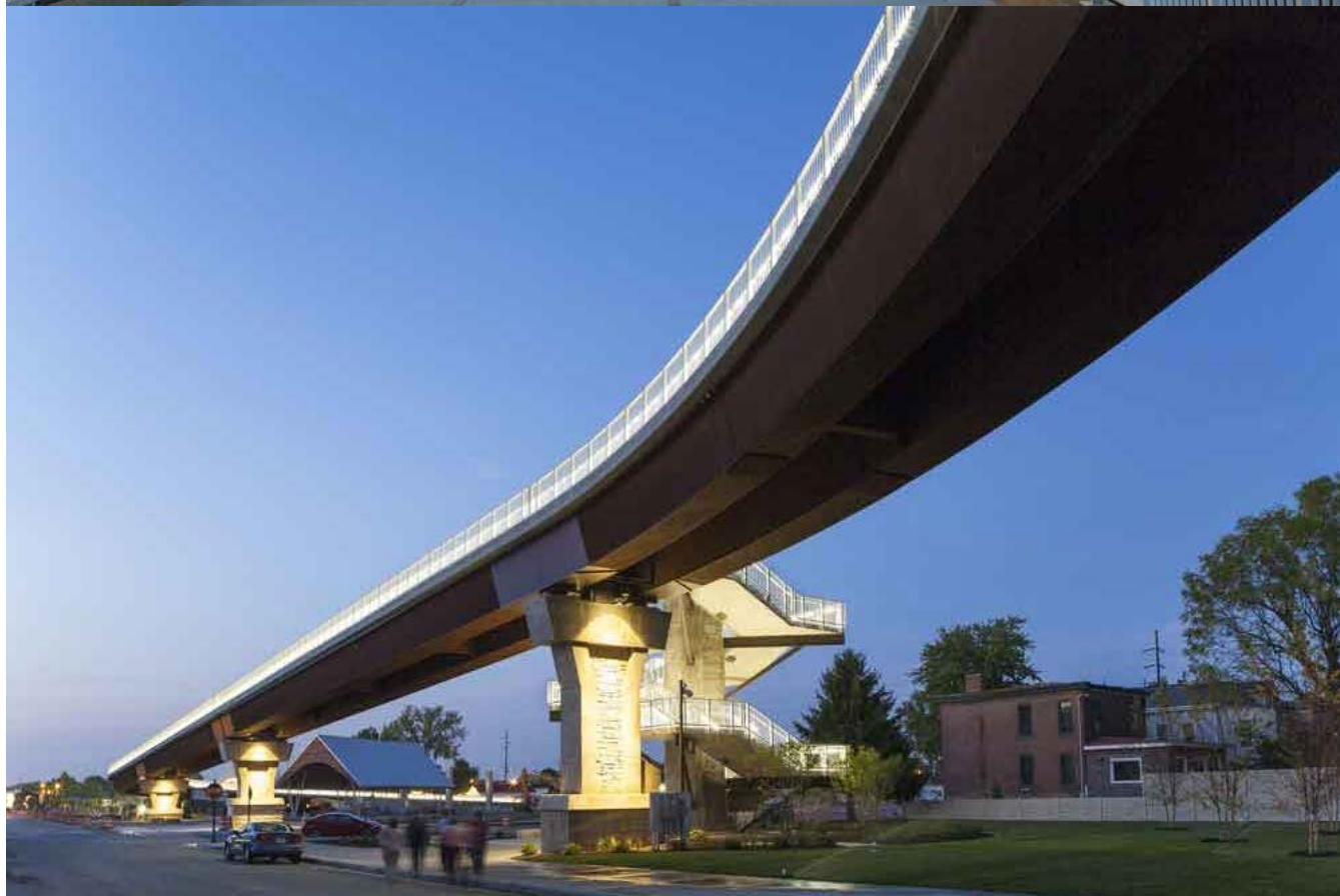
Big Four Station in Jeffersonville