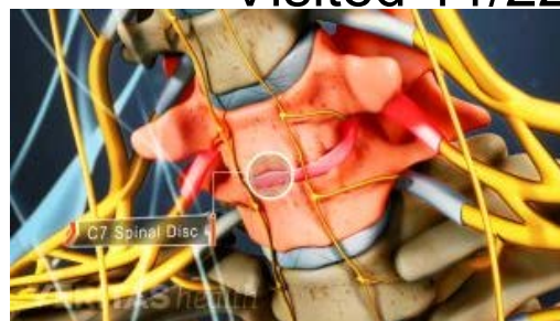
Radiculopathy, Radiculitis and Radicular Pain