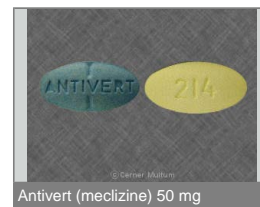
Antivert (meclizine) 50 mg