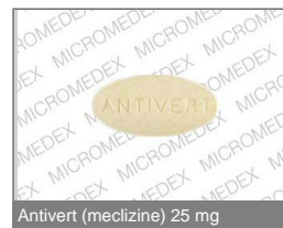
Antivert (meclizine) 25 mg