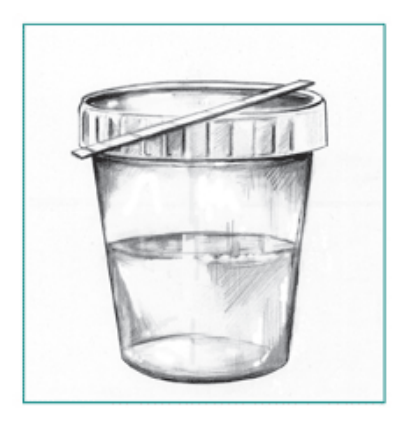
Cup for a single urine sample.

In recent years, researchers have found that a single urine sample can provide the needed information. In the newer technique, the amount of albumin in the urine sample is compared with the amount of creatinine, a waste product of normal muscle breakdown. The measurement is called a urine albumin-to-creatinine ratio (UACR). A urine sample containing more than 30 milligrams of albumin for each gram of creatinine (30 mg/g) is a warning that there may be a problem. If the laboratory test exceeds 30 mg/g, another UACR test should be done 1 to 2 weeks later. If the second test also shows high levels of protein, the person has persistent proteinuria, a sign of declining kidney function, and should have additional tests to evaluate kidney function.