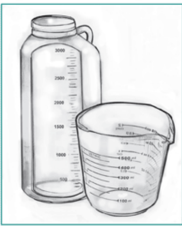
Containers for a 24-hour urine collection.

In recent years, researchers have found that a single urine sample can provide the needed information. In the newer technique, the amount of albumin in the urine sample is compared with the amount of creatinine, a waste product of normal muscle breakdown. The measurement is called a urine albumin-to-creatinine ratio (UACR). A urine sample containing more than 30 milligrams of albumin for each gram of creatinine (30 mg/g) is a warning that there may be a problem. If the laboratory test exceeds 30 mg/g, another UACR test should be done 1 to 2 weeks later. If the second test also shows high levels of protein, the person has persistent proteinuria, a sign of declining kidney function, and should have additional tests to evaluate kidney function.