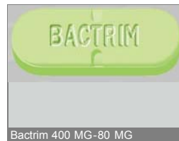
Bactrim 400 MG-80 MG