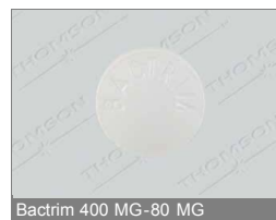
Bactrim 400 MG-80 MG