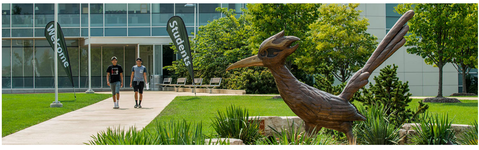
Home | About COD | Board of Trustees