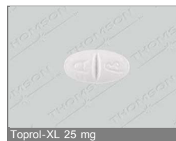
Toprol-XL 25 mg