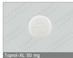
Toprol-XL 50 mg