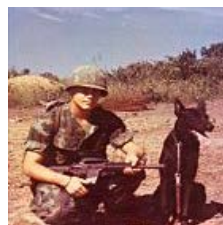
Statue to honor canines - JSOnline (Journal Sentinel)