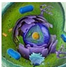
Best 5 College Courses You Should Just Take Online (Education Portal)