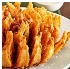
30 Secret Restaurant Recipes Revealed (Food Network)