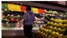
Slow to Cut Prices, Whole Foods Is Punished