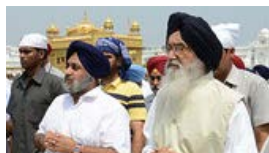
In India, a Political Dynasty Prospers