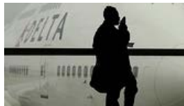
Frequent Fliers: The Best Airlines by Miles