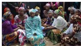
Search Torments Nigerian Parents