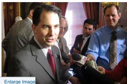
Wisconsin Gov. Scott Walker