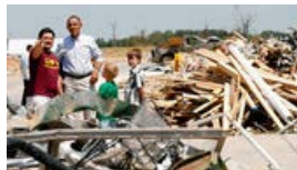
Climate Push Faces a Lukewarm Public