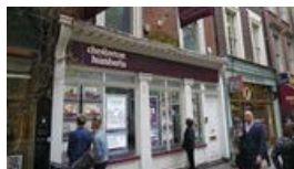
Hunt for Gadhafi-Era Assets Leads to London