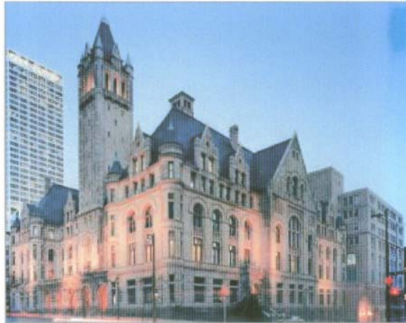
Courthouse at Dusk

One of the most striking examples of Landmark buildings in the United States is to be found in the historic United States Courthouse and Federal Building located in Milwaukee, Wisconsin. Originally authorized for principal use as a United States Post Office, Court and Customs House, land located just three blocks from Lake Michigan in downtown Milwaukee was acquired by Congress through a series of acts approved beginning in 1889. The 2.1 acre parcel, consisting of an entire block bounded by Wisconsin Avenue on the north, Michigan Street on the south, Jackson Street on the east and Jefferson Street on the west, was secured through condemnation with an award of $388,354 on October 31, 1890.