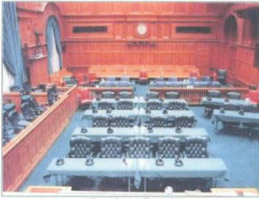
View from Bench Ceremonial Courtroom

The building remained under the control and management of the U.S. Postal Office Department until 1939, when it was taken over by the Public Building Administration (PBA). The following year PBA became a branch of the Federal Works Agency which, in 1949, was absorbed by the General Services Administration (GSA). The building is currently maintained by the Public Buildings Service (PBS), a service of GSA.