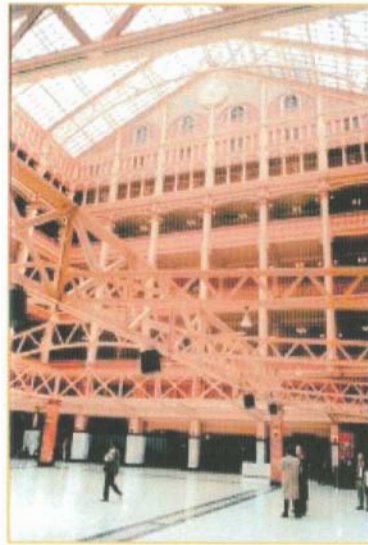
Atrium - View 1

The building facade is broken into recesses and projections, creating a dynamic composition punctuated by an arcaded entrance on the first level and Roman arches over the second and third story fenestration. The massive stone forms are relieved with fine decoration including Romanesque carved moldings and detailed stonework which surrounds the arcaded main entrance and second floor portico. The corners of the original structure are rounded with tall pinnacles that again include alternating bands of smooth and rough-faced granite and are capped with conical roofs of copper and slate. Like the facade, the east and west elevations are ornamented and symmetrically balanced, prominently featuring a projecting gable with a variety of arched fenestration.