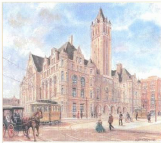
Federal Courthouse in 1899

To be sure, the United States Courthouse and Federal Building in Milwaukee, Wisconsin, has endured the test of time as an architectural "Crown Jewel" and will continue to be treasured as a functional part of our nation's history.