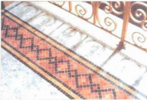
Detail of Inlaid Mosaic Floor

Two additions, the first of which was completed in 1932, added five stories, a basement and sub-basement on the south side of the original structure, and a second, completed in 1941, added two additional floors. Like the 1899 structure, the exterior is clad in granite and includes some arched fenestration to replicate the original design. However, owing to both architectural and economic considerations, the addition lacks both the gable and steeply hipped slate roof as well as much of the ornamentation found in the original design. The interior corridors and lobbies are marked with much less ornamentation, which includes steel doors and frames rather than traditional raised-panel wood doors and frames, terrazzo floors rather than marble, and more limited ornamentation in the plastered ceilings.