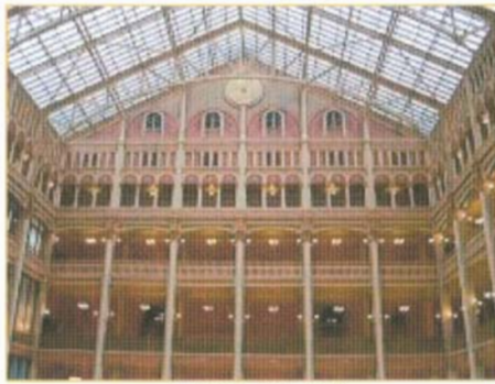
Atrium - View 2

When the building opened, the entire first floor was occupied by its largest tenant, the U.S. Post Office. The third floor was occupied principally by the U.S. Courts, and later included offices for the United States Attorney and U.S. Marshal. The second, fourth and fifth floor tenants included the Bureau of Animal Industry, Civil Service, Customs, Internal Revenue, Lighthouse Inspector, Locomotive Inspector, Oleomargarine Department, Pension Examiner, Postal Inspectors, Railway Mail Service, Steamboat Inspectors, U.S. Engineer, Weather Bureau and the Wine and Spirit Department.