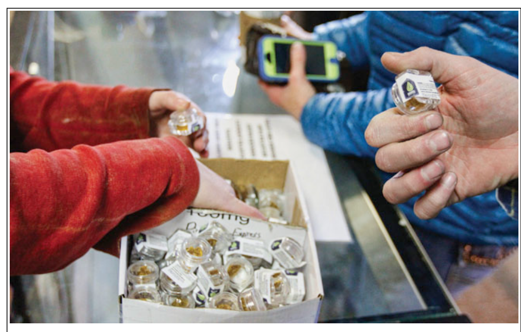
A "budtender" shows customers some hash oil at Evergreen Aphothecary in Denver.

already existing market made legal. An opportunity to get in on the ground floor of a new industry, to become the Budweiser of marijuana, to secure family wealth for generations."