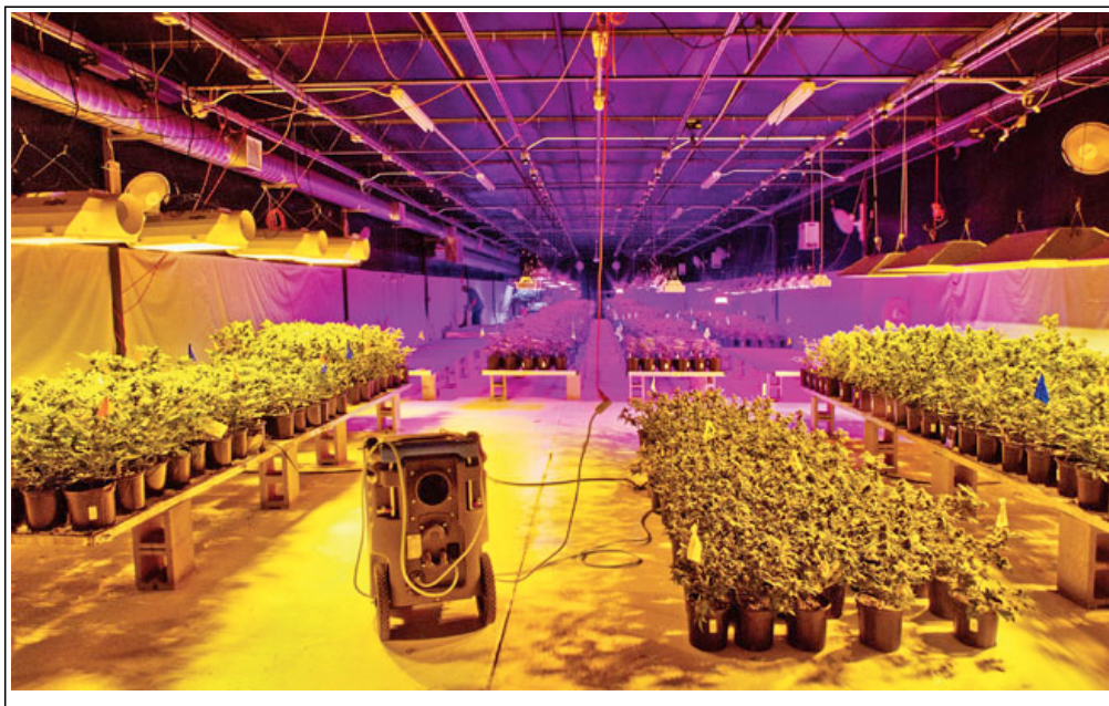
Marijuana plants grow in the flowering room at Compassionate Care Foundation, a medical marijuana dispensary in New Jersey.