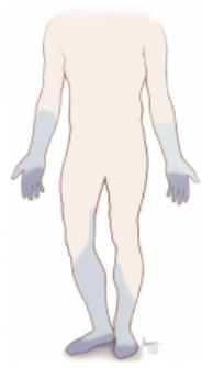
FIGURE 1. Symptoms are pain, burning, numbness, and autonomic dysfunction (lack of sweating) in the hands and feet in a stocking-glove distribution. Strength is not affected. Tendon reflexes are normal, as are nerve conduction studies.

The past 2 decades have seen the development of specialized tests that have greatly facilitated the diagnosis of small fiber neuropathy; these include skin biopsy to evaluate the density of nerve fibers in the epidermis and studies of autonomic nerve function. Common etiologies have been identified for small fiber neuropathy and can be specifically treated, which is critical for controlling progression of the disease. Pain management is becoming easier with more available options but is still quite challenging.