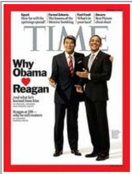
Life imitates parody