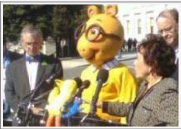
Vermin on the Hill

On July 2nd, 2010 at 2:37 pm, hawkeye54 said: #7 I wonder who was on the other end of that phonecall. I hope it wasn't one of the Obama daughters.